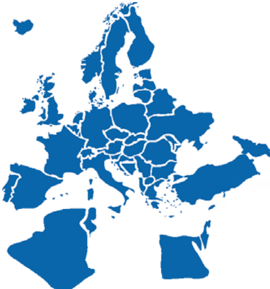
Map of MLA signatories in December 2023

Therefore, the marketplace can have confidence in activities of the EA MLA signatories and their accredited conformity assessment bodies. The EA MLA provides the European market with a network of conformity assessment bodies that are competent within their scope of accreditation to issue reliable and credible statements of conformity for products and services, thereby reducing costs and adding value to business and consumers. This contributes to the freedom of trade by eliminating technical barriers.